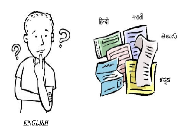
Fig. 1 CLIR scenario of a user trying to access information present in different languages [6]

Cross Language Information Retrieval (CLIR) can be defined as the process of retrieving information present in a language different from the language of the user's query. A typical CLIR scenario is shown in the Fig. 1 Where a user needs to retrieve documents from different Indian Languages using query in English. CLIR bridges the gap between information need (query) and the available content (documents).